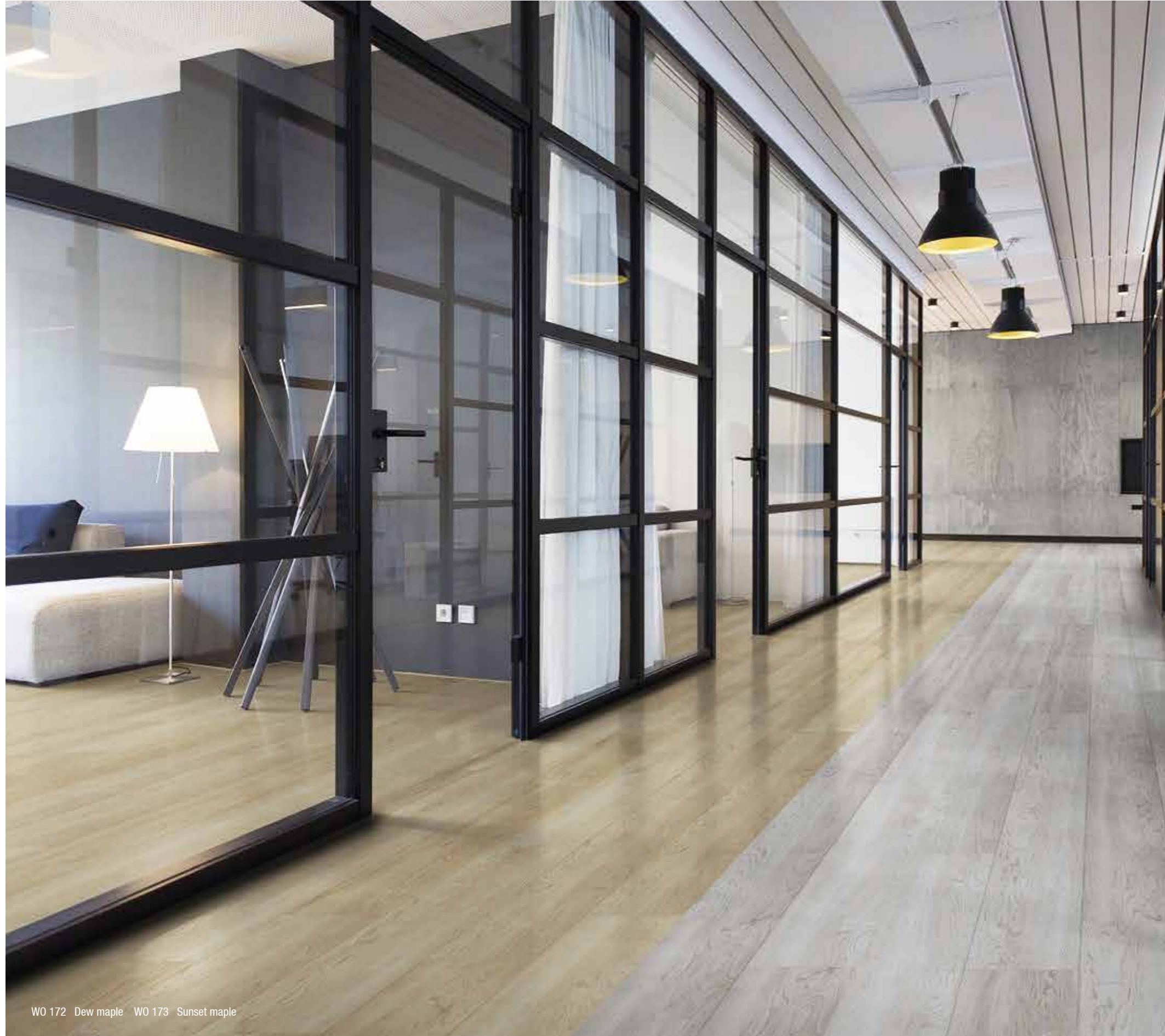
WO 172 Dew maple WO 173 Sunset maple