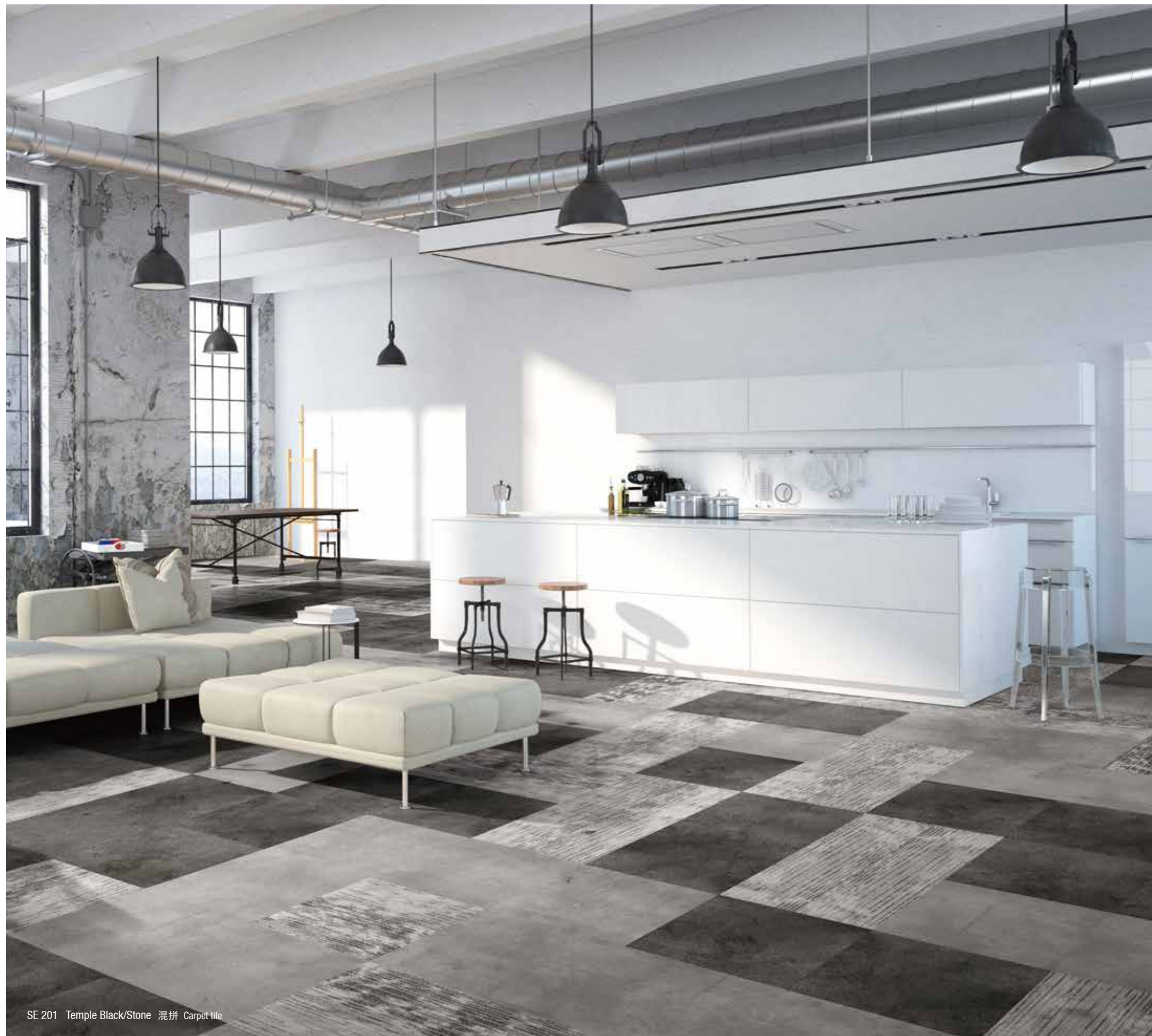
SE 201 Temple Black/Stone 混拼 Carpet tile