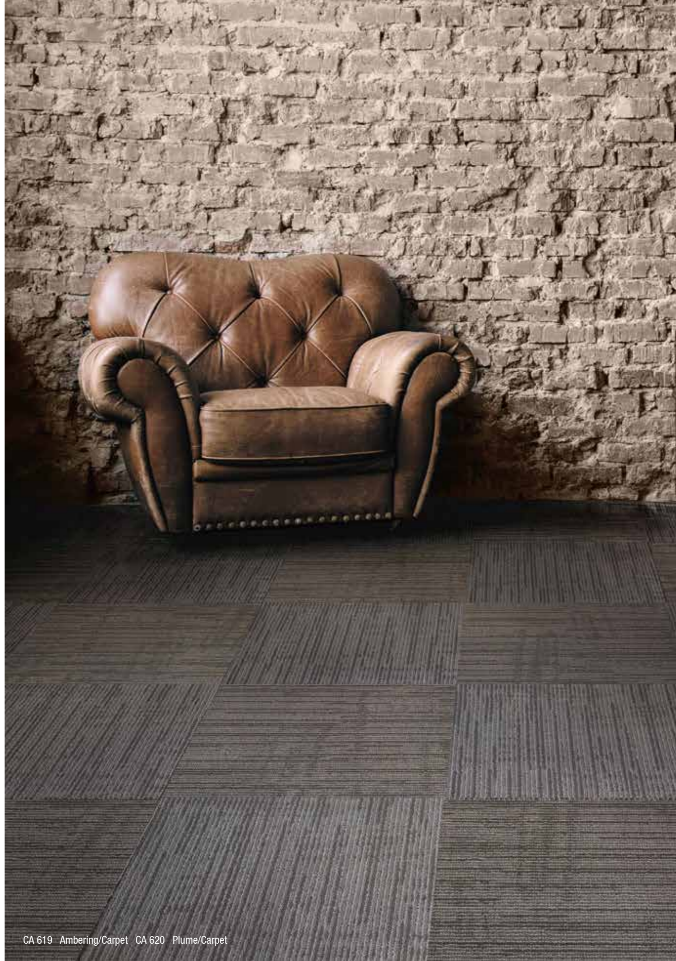
CA 619 Ambering/Carpet CA 620 Plume/Carpet