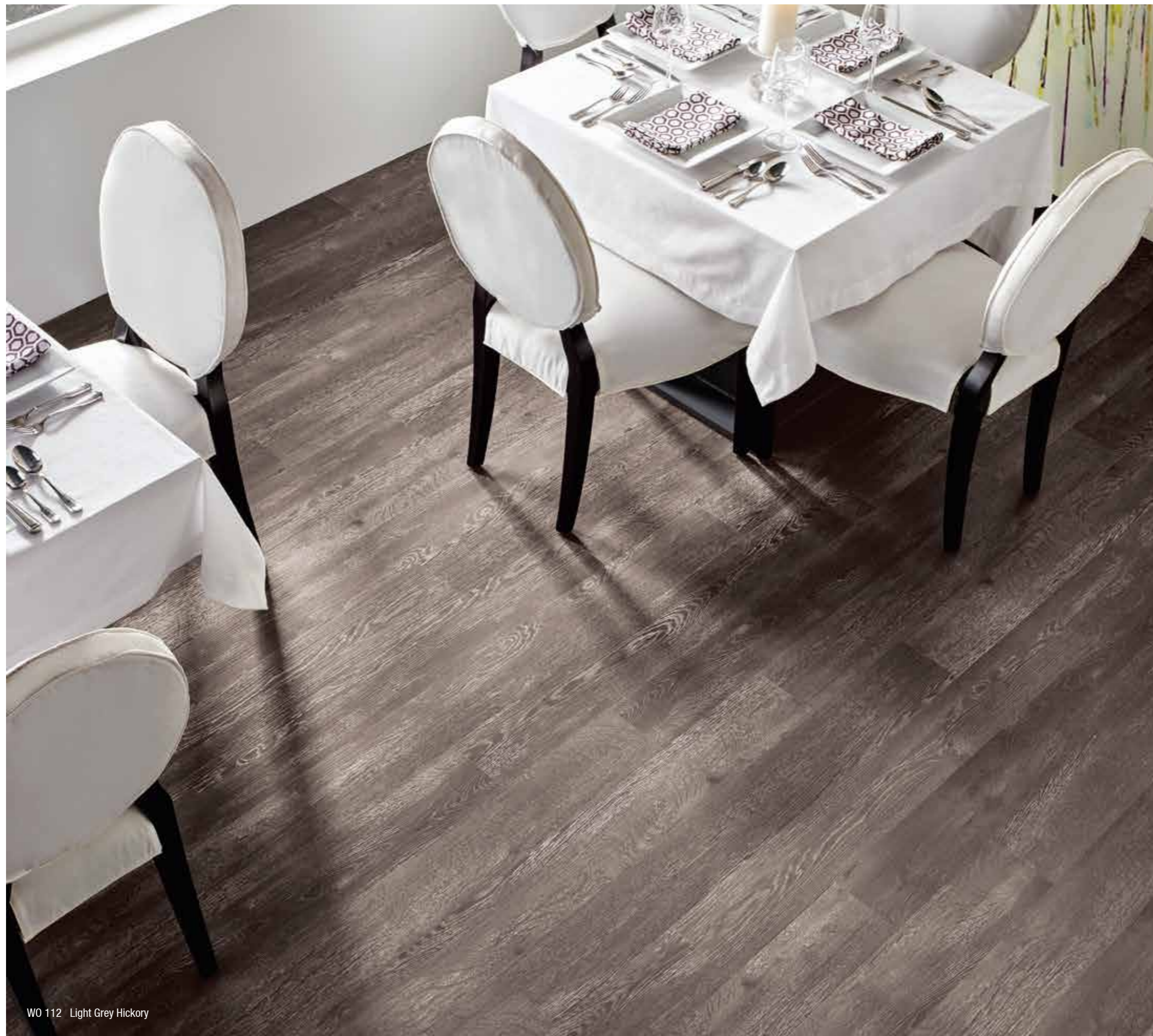
WO 112 Light Grey Hickory