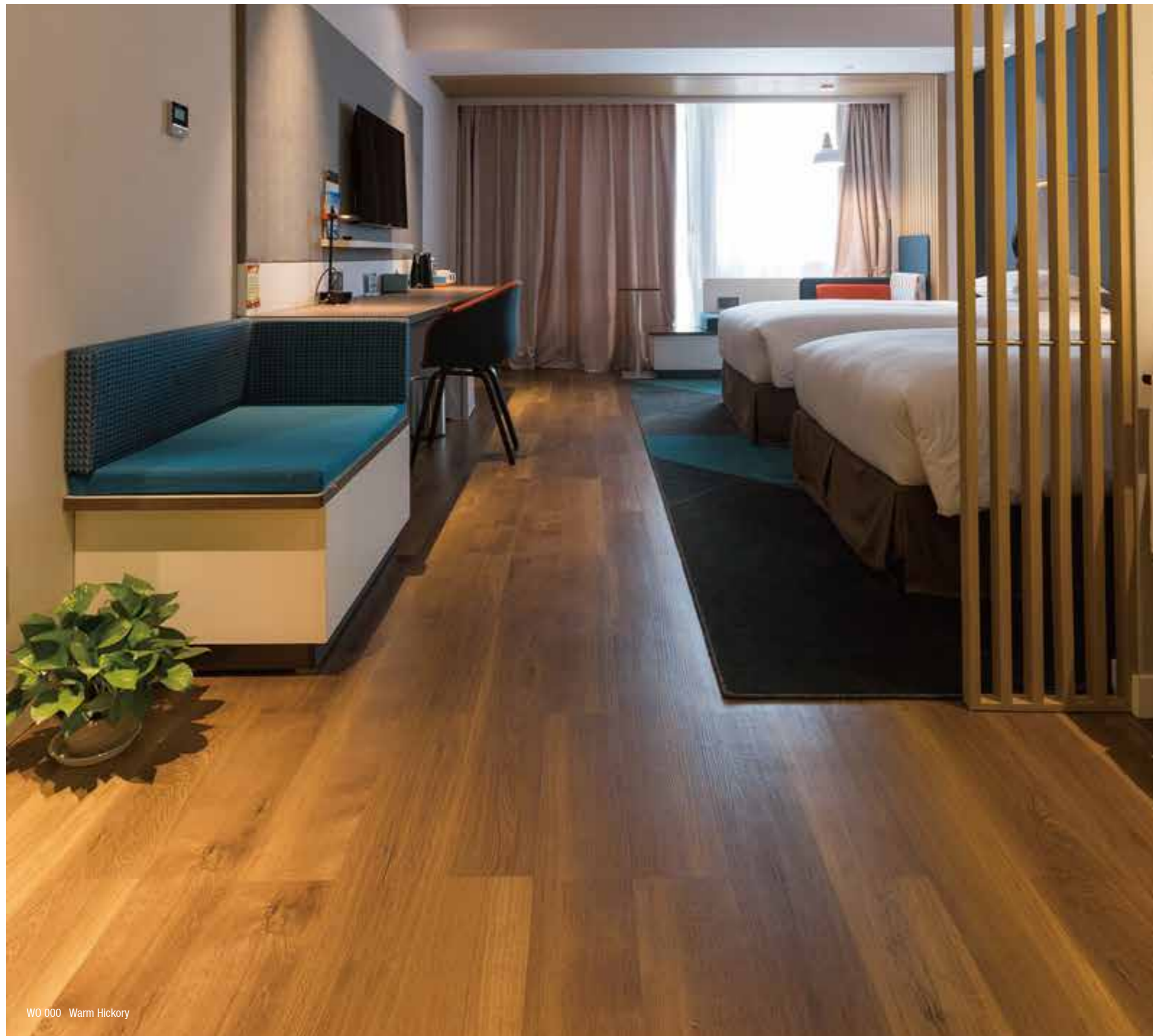
W0 000 Warm Hickory