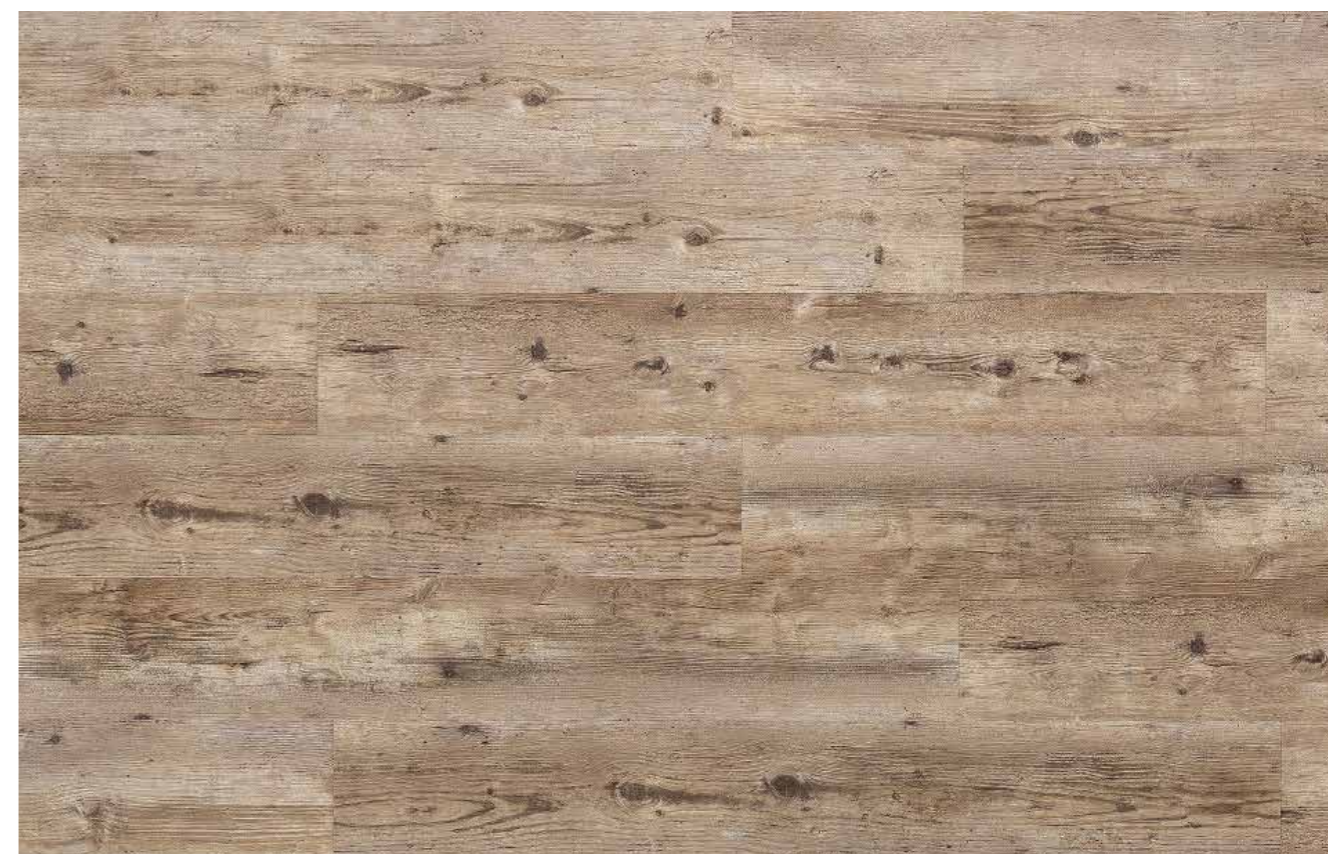
■ WO 026 184.15mm×1219.2mm