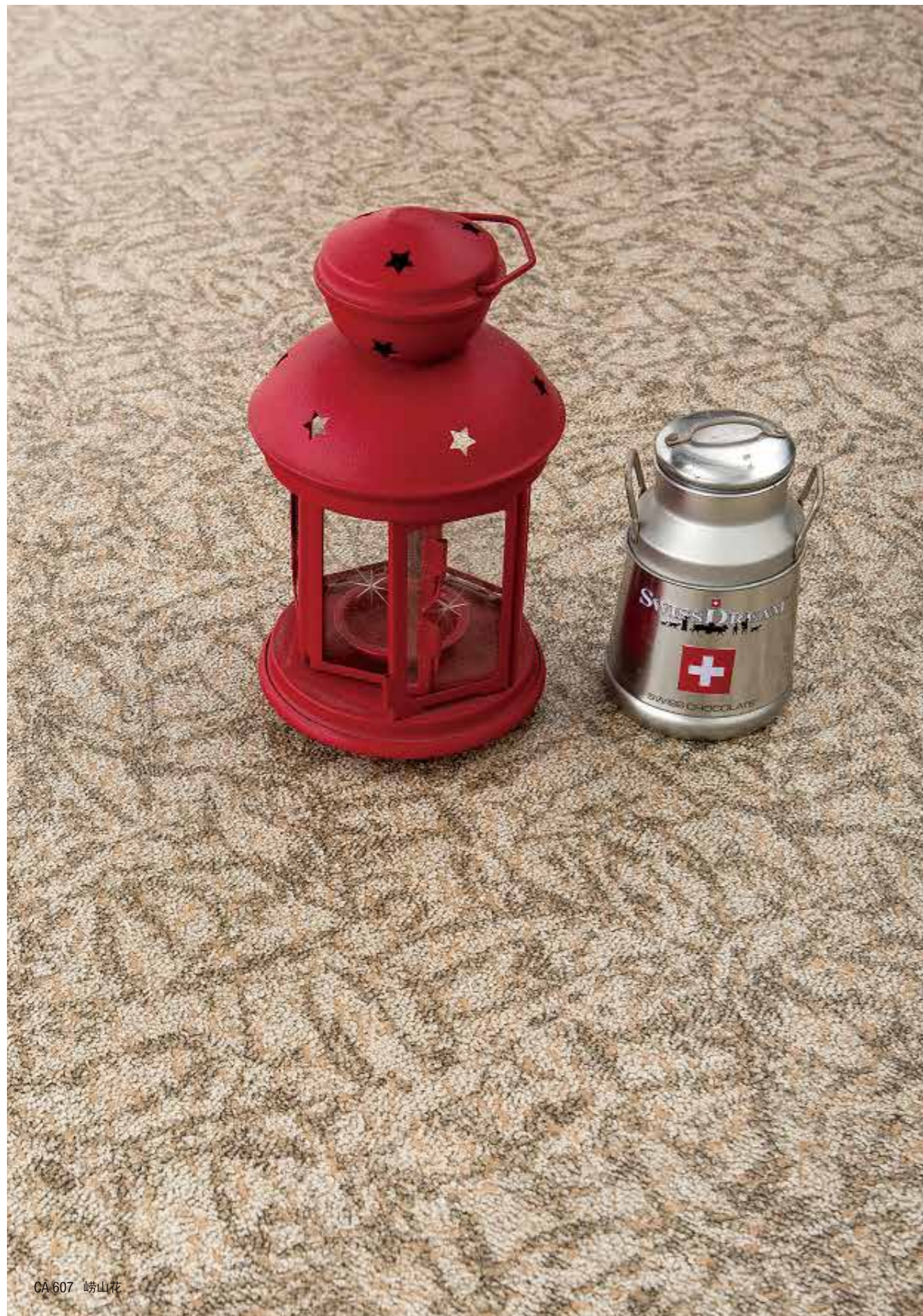
CA 607 崂山花