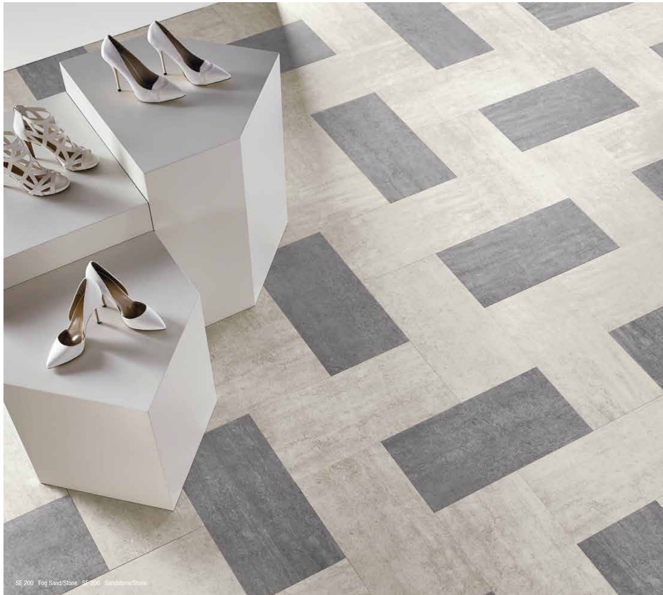
SE 200 Fog Sand/Stone SE 206 Sandstone/Stone