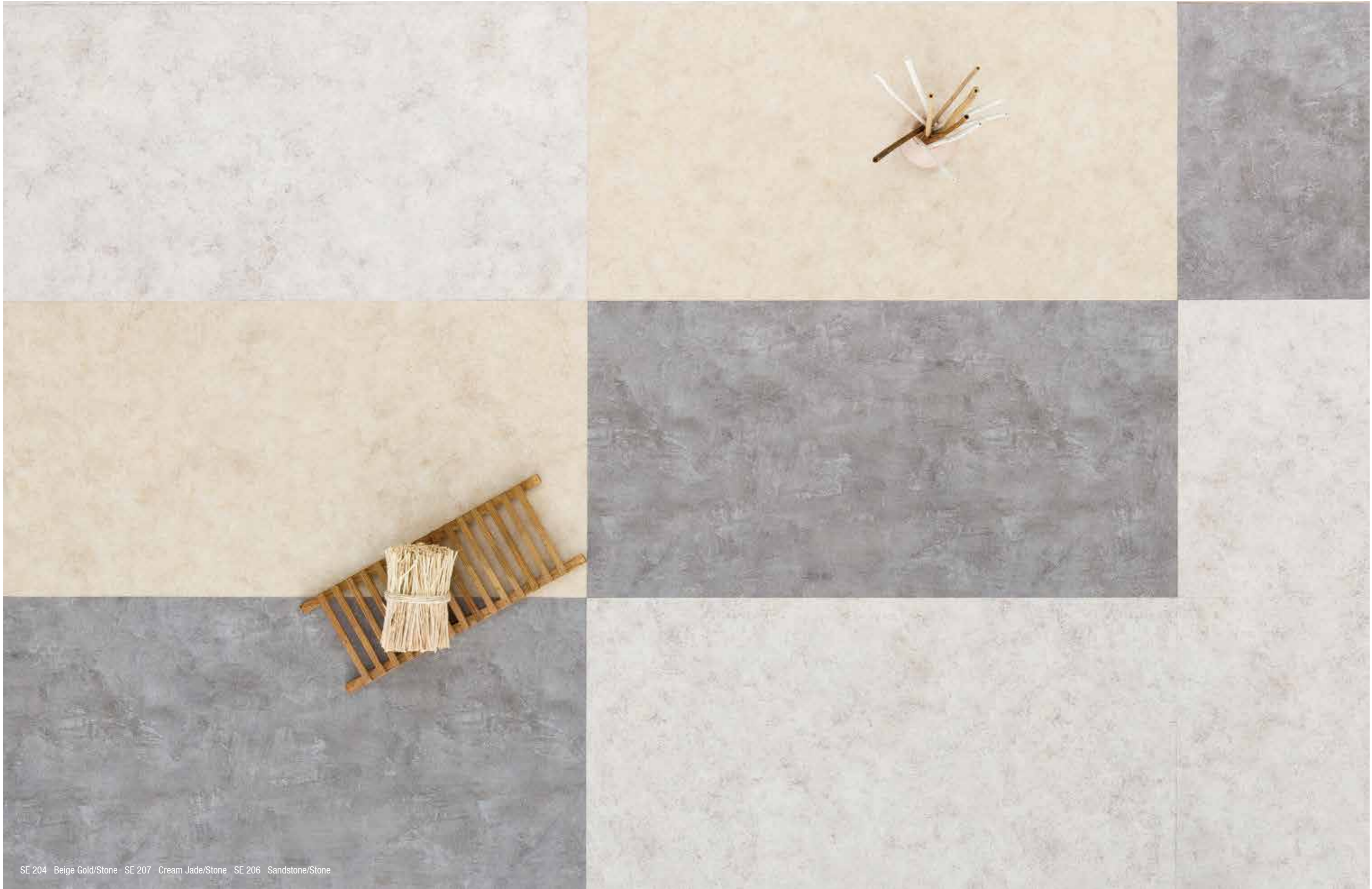
SE 204 Beige Gold/Stone SE 207 Cream Jade/Stone SE 206 Sandstone/Stone