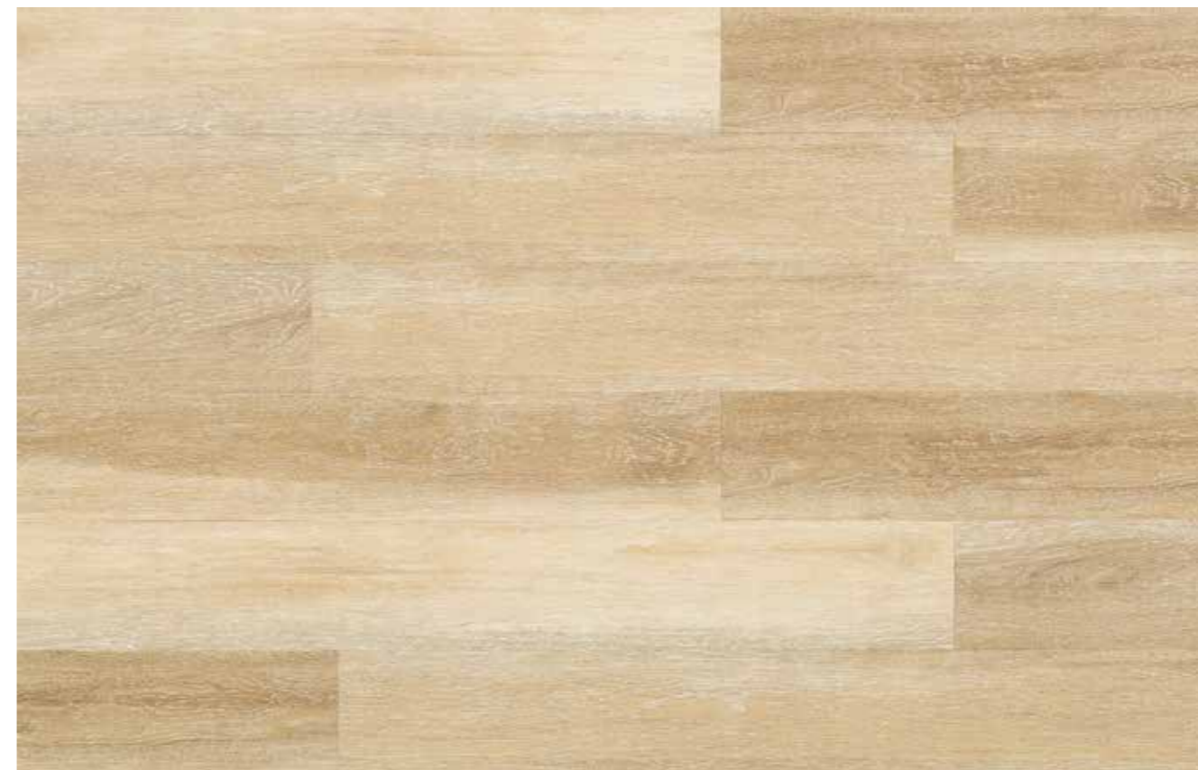
■ WO 108 184.15mm×1219.2mm