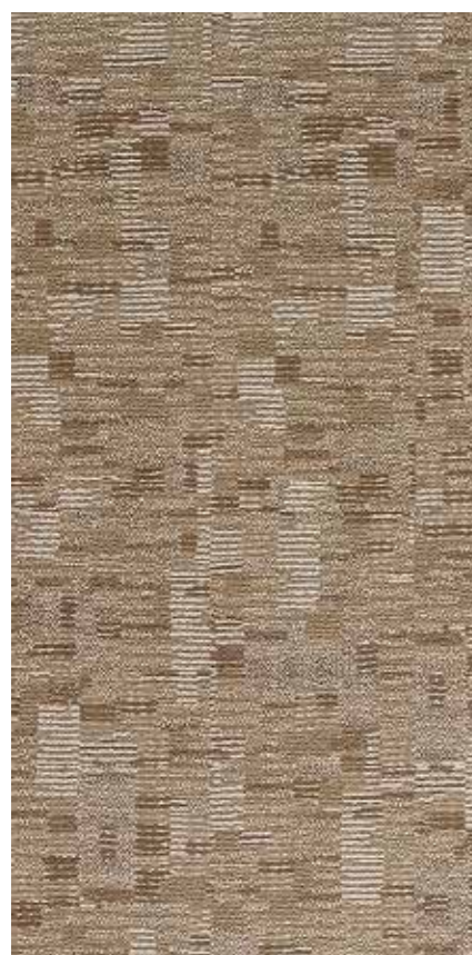
CA 624 457.2mm×914.4mm 457.2mm×457.2mm